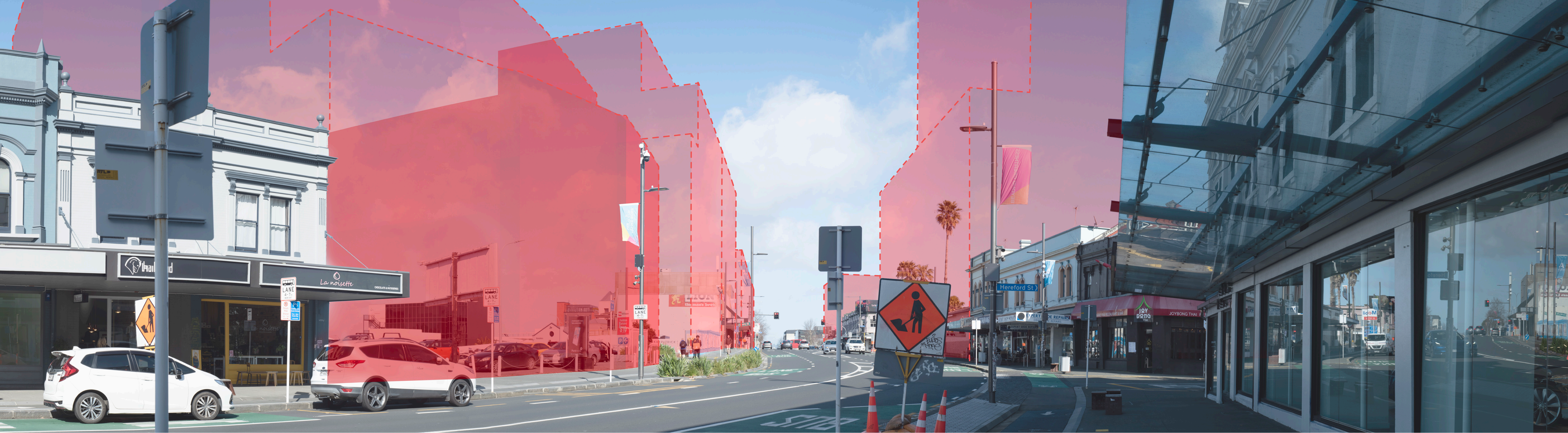
Figure 4c. Viewpoint 01 - Plan change 78 standards.