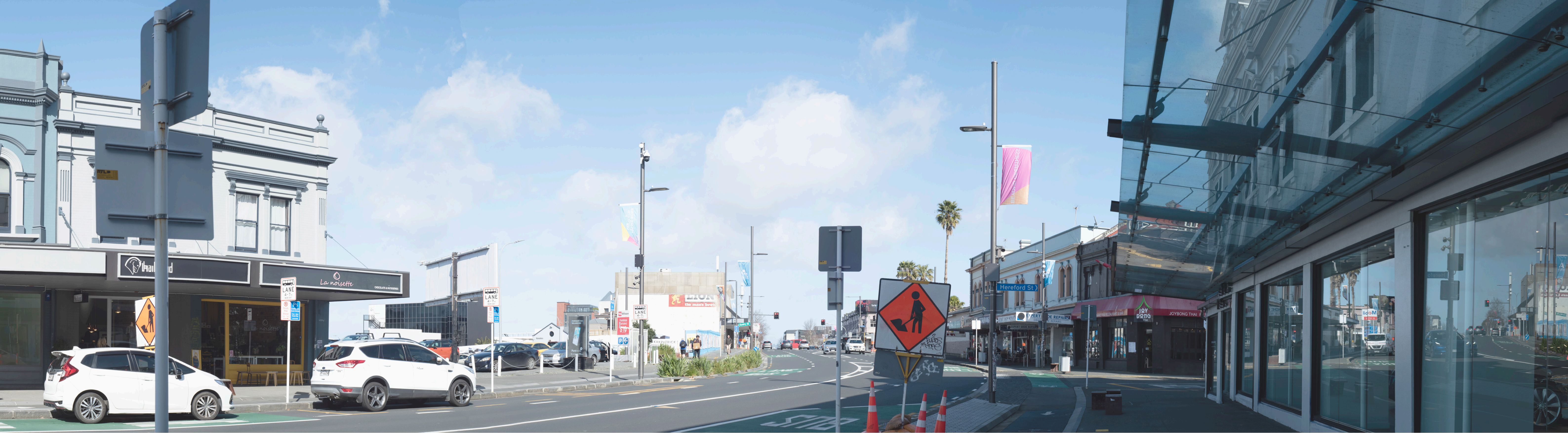
Figure 2. Viewpoint 01 - Existing.

View from the northern side of Karangahape Road (near #501) looking southwest towards the site.