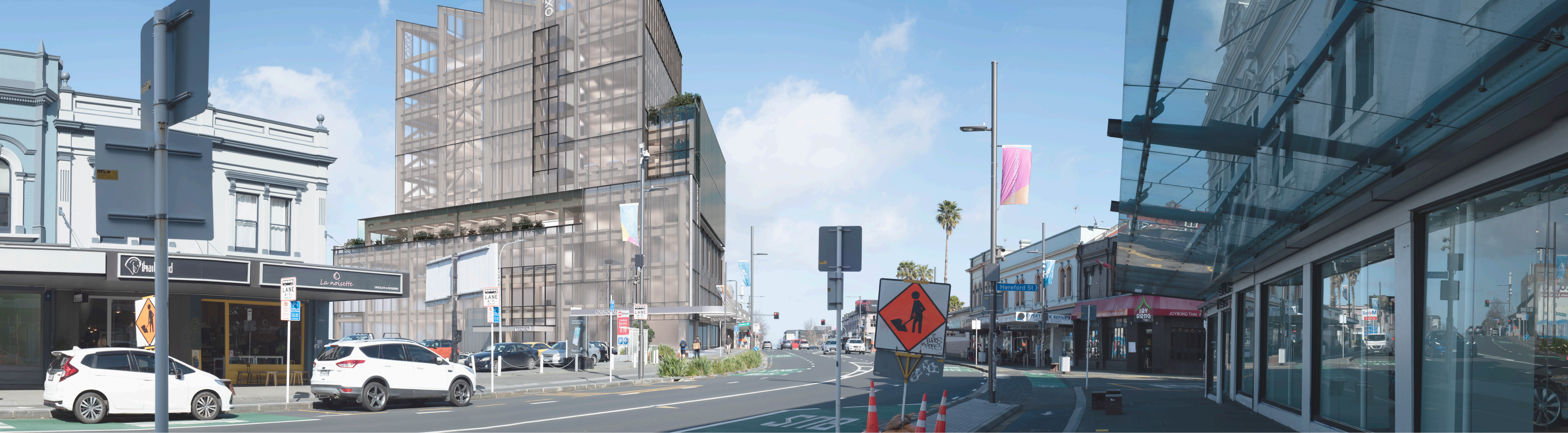
Figure 3. Viewpoint 01 - Proposed.

View from the northern side of Karangahape Road (near #501) looking southwest towards the site.