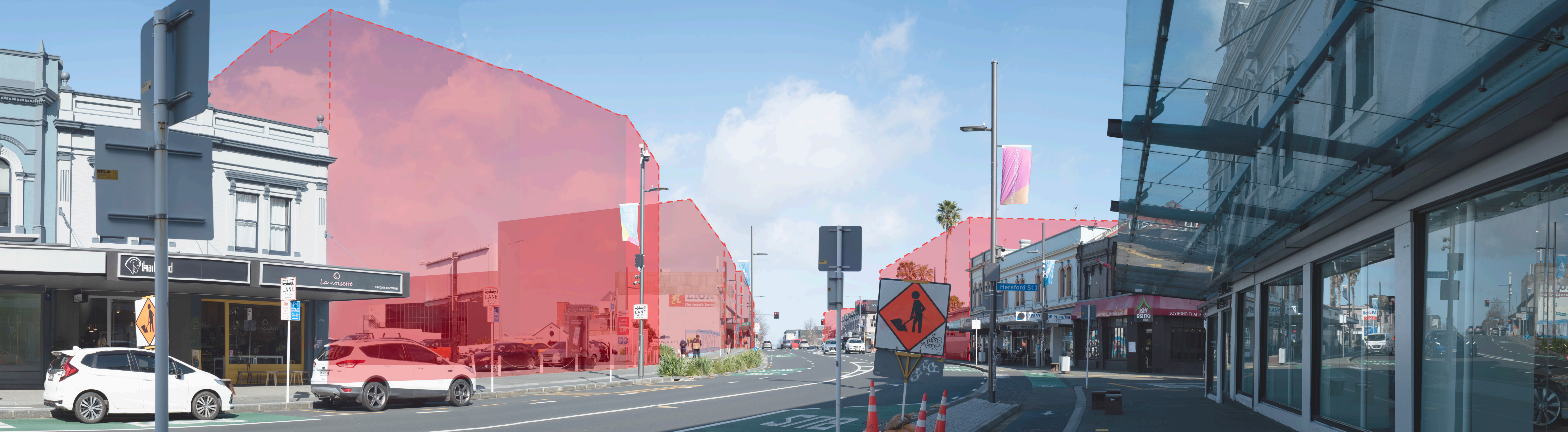
Figure 4b. Viewpoint 01 - Current AUP standards.