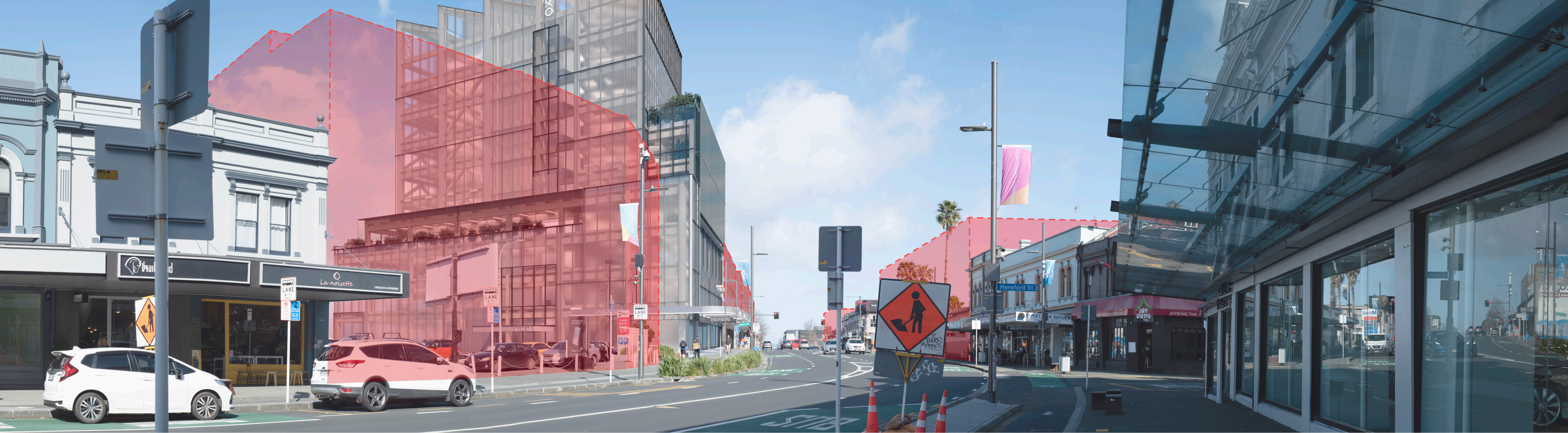
Figure 4a. Viewpoint 01 - Proposed.